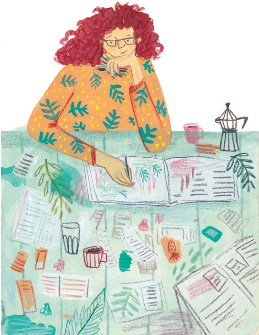
illustration: Sarah van Dongen

There are many different ways in which you can make money with your art, and maybe you're already working on some. Encircle which markets/directions you would like to explore. (Can be more than one. If you are already working on some, use different colors.)