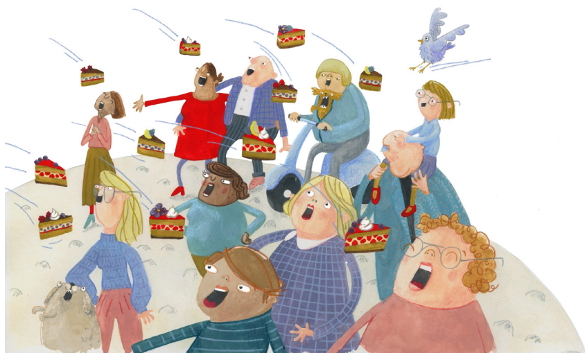
illustration: Dorien Bellaar