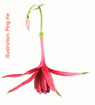
illustration: Ping He

Are there solutions to these problems? (Maybe you can ask for help, prioritize differently,)