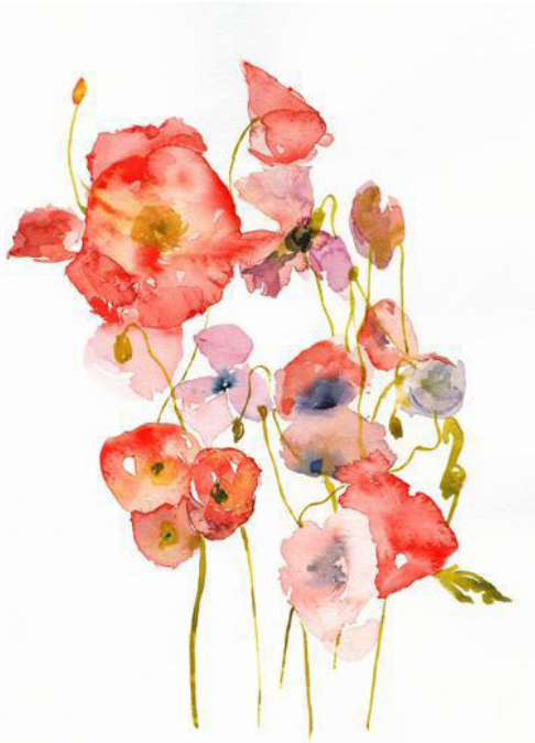
illustration: Ping He