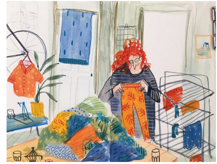
illustration: Sarah van Dongen

Are there things that are holding you back? (For example: you might have little time, you have a lot of other responsibilities, you are unable to find clients, your don't have all the necessary skills, you feel distracted or you are a procrastinator, etc.)