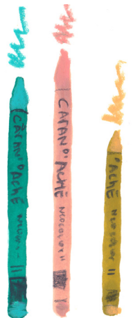
illustration: Sarah van Dongen

What do you want people to feel when they look at your art?